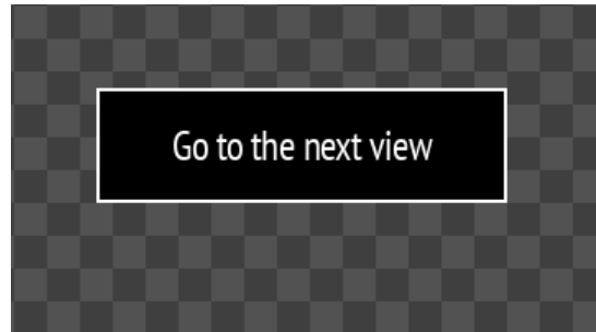
Figure 1. The FirstView with the button