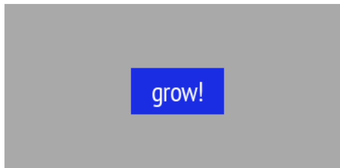
Figure 2. Result