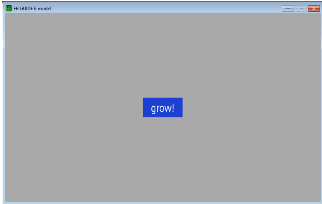
Figure 2. Result